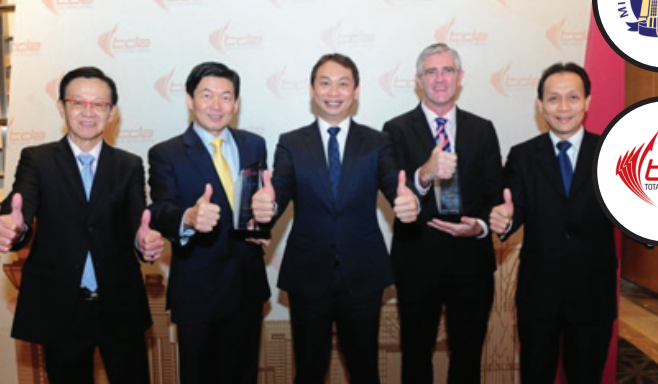
The Singapore Manufacturing Federation (SMF), SMF's President and Council Members are amongst the proud recipients of the TDA NS Advocate Award.

Since 1986, recognition for NS stakeholders such as SMEs, large companies and organisations is important to inspire more stakeholders in the business community to step forward to give their unwavering support as well as to strengthen the commitment and support for NS.