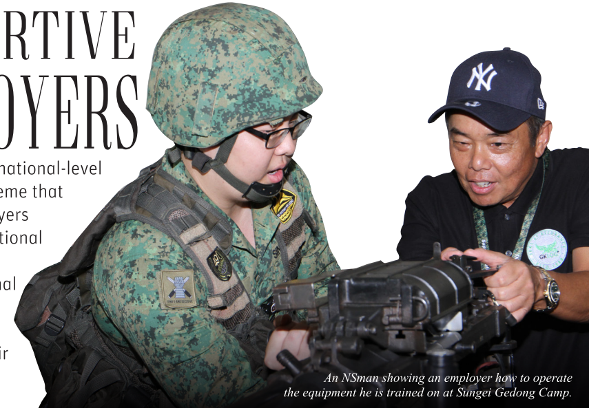
An NSman showing an employer how to operate the equipment he is trained on at Sungei Gedong Camp.

The NS Mark is a national-level accreditation scheme that recognises employers for supporting National Service (NS) and facilitating National Servicemen's (NSmen's) completion of their NS commitment.