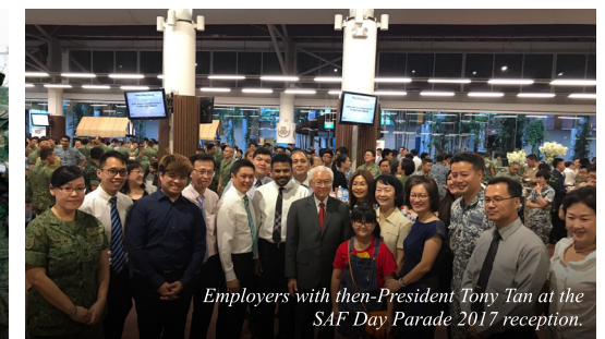
Employers with then-President Tony Tan at the SAF Day Parade 2017 reception.