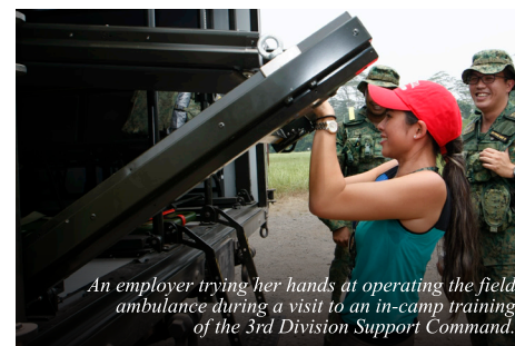
An employer trying her hands at operating the field ambulance during a visit to an in-camp training of the 3rd Division Support Command.