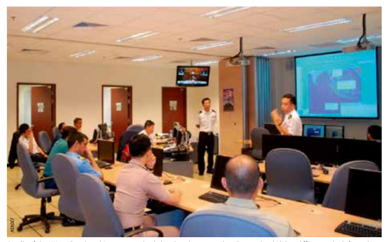
Details of the MH370 Search and Locate operation being shared among various International Liaison Officers at the Information Fusion Centre.

sets Singapore apart in how it has 'lengthened' operationally. Comprising RSN and International Liaison Officers (ILOs) across the globe from different parent agencies like Customs, Immigration, Defence, etc., the ILOs serve as conduits between the IFC and their respective nation-parent agencies.43 The IFC operates as a maritime information hub with extensive links to 64 agencies in 34 countries.<sup>44</sup> It has a common maritime picture collated from various information sources, both through its partners as well as through new technologies such as the satellite-based Automatic Information System (AIS) and Long Range Identification Tracking System (LRIT). Information sharing portals, such as the Regional Maritime Information Exchange (ReMix) and the Malacca Straits Patrol Information System (MSP IS) can be tailored to allow relevant information in the form of a common maritime picture, reports and pictures to be exchanged