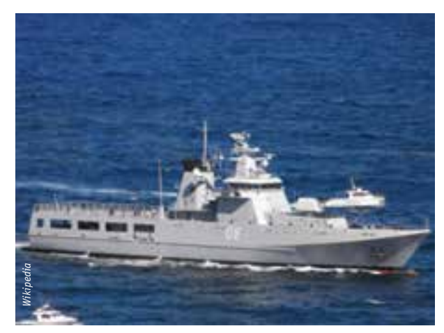
KDB Darulaman at the Royal Australian Navy International Fleet Review 2013.

Brunei Darussalam has over 200 offshore oil and gas platforms within its Economic Exclusive Zone (EEZ). The need to continuously monitor and protect these key installations from maritime terrorism or acts of sabotage has posed a great challenge for its security and enforcement agencies. Brunei's other main maritime threats include: man-made disasters, e.g. collisions that result in massive oil spills and transnational crime 'smuggling and Illegal, Unregulated and Unreported (IUU) Fishing'.<sup>12</sup>