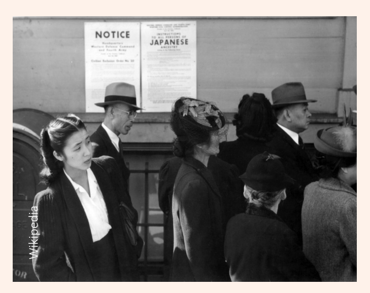
Japanese Americans in front of posters with internment orders.

Therefore, just as in the case of military mobilisation, the level of quantitative economic impact that WWII has, significantly surpasses that of WWI.