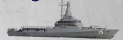
INDEPENDENCE-CLASS LITTORAL MISSION VESSEL

Length: 47.5 metres Speed: In excess of 15 knots Displacement: 360 tonnes