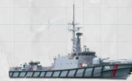
SENTINEL-CLASS MARITIME SECURITY AND RESPONSE VESSEL

Length: 80 metres Speed: In excess of 27 knots Displacement: 1,250 tonnes