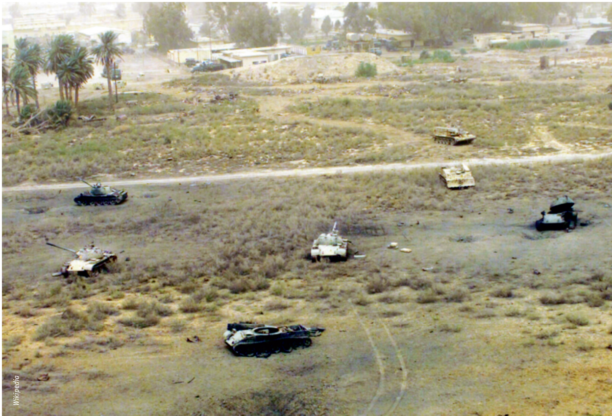
Destroyed remains of Iraqi tanks near Al Qadisiyah during Operation Iraqi Freedom.

Mass Destructions (WMD) remains unverified to-date, leaving the act of 'self-defence' by the US as technically unjustified. 34 This has had a detrimental impact on the US as countries increasingly question the motives of its foreign policies. In proposing the above five conditions, this essay maintains that war should be avoided unless absolutely necessary. Only where the five conditions are satisfied, is a pre-emptive strike justifiable. Otherwise, the loss of lives, stature and resources would be colossal. In the case of a small state, this price might be costly beyond national capacity.