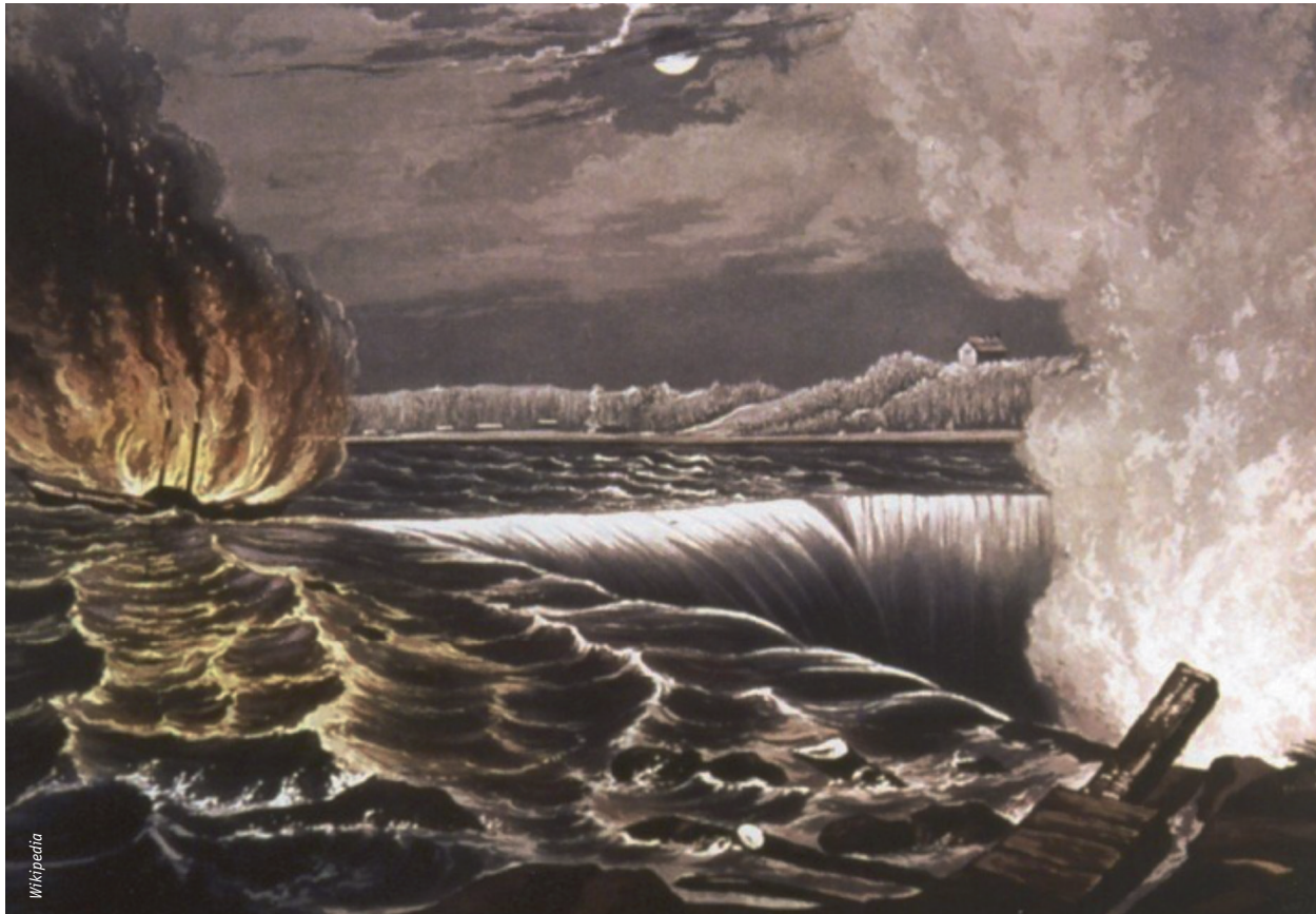
The destruction of the American steamboat SS Caroline on the Niagara River in 1837.

Most of the nine aforementioned factors are applicable to Singapore. Having established the strategic relevance of pre-emptive warfare for small states like Singapore, the essay shall proceed to study the factors of justification for pre-emptive warfare.