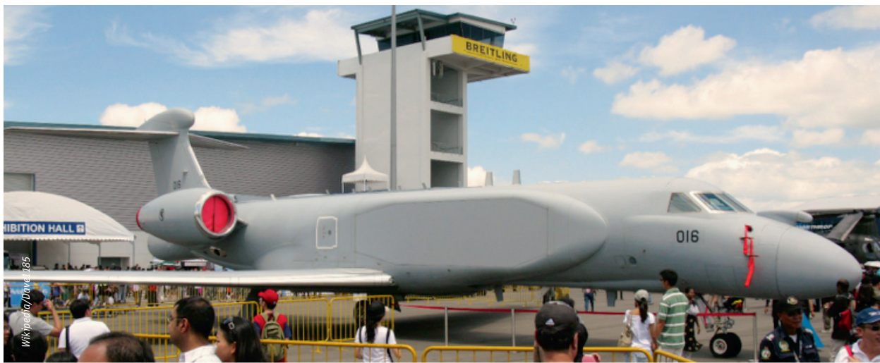
A G550 CAEW of 111 Squadron, Republic of Singapore Air Force on display at the Singapore Air Show 2010.

Intelligence is important in determining the adversary's political intent to guide the SAF in acting not-too-early to be considered a preventive war agitator and not-too-late such that the SAF has to suffer the first blow from the adversary. In gathering the political intent of the adversary, some countries have gone to the extent of accessing an adversary's political leadership via Human Intelligence (HUMINT). 38 The pitfall is that HUMINT is near-impossible to embed, takes a long process to cultivate and may be financially and politically costly to sustain. Political signals may also be sensed from speeches, white papers, interviews, official releases and diplomatic platforms. An emerging field of technology is network analysis to connect-the-dots on multiple signs of intent to invade. 39 Futuristic tools like fleets of fly-sized drones may be applicable for intelligence missions. 40 In order to