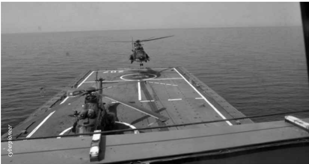
An RSAF Super Puma taking off from the deck of Landing Ship Tank RSS Endurance while in the Gulf of Aden as part of multinational anti-piracy efforts there.

In 1993, the RSAF embarked on its first United Nations (UN) mission by sending four Super Puma helicopters and 65 personnel to Cambodia to assist the UN Transitional Authority in Cambodia (UNTAC) during the electoral process. 14 Since then, the RSAF has expanded her international peace-keeping efforts to include sending UH-1H helicopters to Timor-Leste (Operations Blue Heron), KC-135 tanker aircraft to the Persian Gulf (Operations Blue Orchid) and Searcher UAVs to Afghanistan (Operations Blue Ridge). In addition, the RSAF had provided humanitarian assistance and conducted disaster relief operations to Indonesia and Thailand during the 2004 Boxing Day Tsunami (Operations Flying Eagle), New Zealand after the 2011 Christchurch Earthquake, the Philippines after Super Typhoon Haiyan in 2013, assisted in search and locate efforts of AirAsia flight QZ8501 in December 2014, deployed CH-47s to help combat forest fires in Chiang Mai in March 2015 and also participated in many multi-lateral counter-piracy missions (Operations Blue Sapphire)