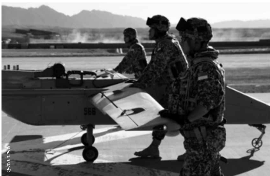
Our UAVs and their operators, under the ambit of Operation Blue Ridge, contributed to the international community's reconstruction efforts to restore stability in Afghanistan.

Since its inauguration on 1 st September, 1968 as the Singapore Air Defence Command (SADC) with a humble fleet of eight Cessna 172s, air power development in Singapore has been driven largely by defence demands. Fresh from the memories of overwhelming