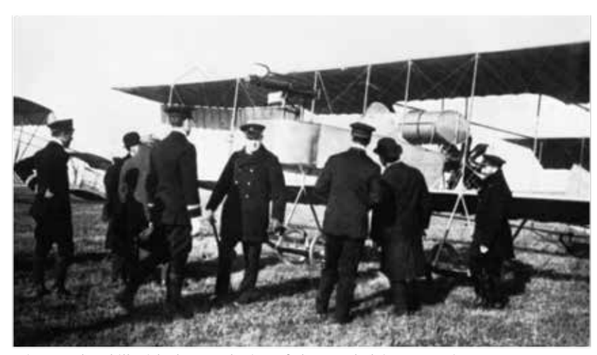
Winston Churchill with the Naval Wing of the Royal Flying Corps. 10

Churchill was more confident than ever that the Allies will go on to win the war against the Axis Powers after the US entered