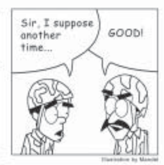
The Fear of Failure can cause great inertia...